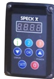
Control Panel replicated to show screen detail